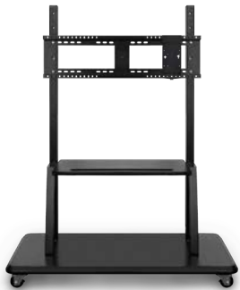
▶ VB-STND-001 mobile trolley cart