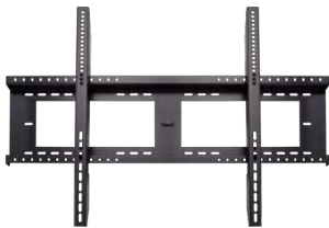
▶ WMK-047 wall mount